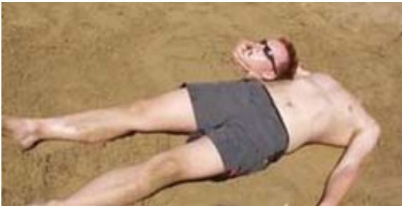
Having a bad summer vacation at the beach