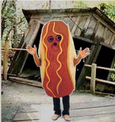
Camp mascot during happier times